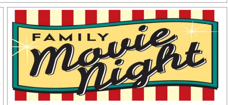
June 8, 6:30 - 8:30 p.m.

Our melodious celebration continues with the Schoenbrunn Valley Barbershop Chorus who will present several selections as our "musical message of the day." Come join us for this special time of praise and thanksgiving.